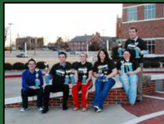
Speech & Debate Team