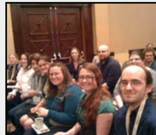
NSU Graduate Students