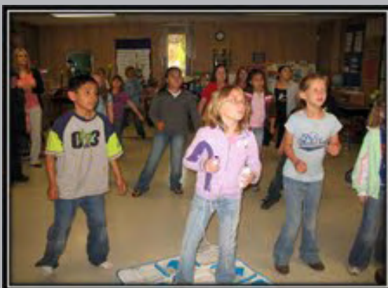
Students from Cherokee Elementary