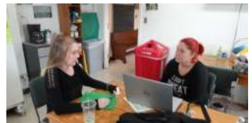
One-on-one peer mentor