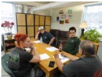
Group meetings once a month.