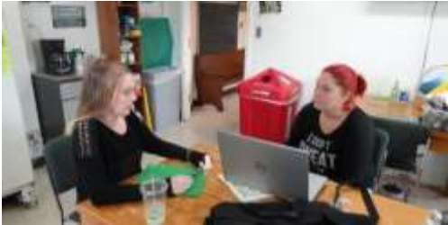
One-on-one peer mentor

Interested in becoming a mentor or a mentee. Contact Sharon at blackfos@nsuok.edu