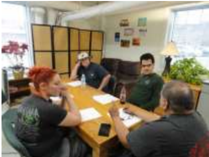
Group meetings once a month.

Interested in becoming a mentor or a mentee. Contact Sharon at blackfos@nsuok.edu