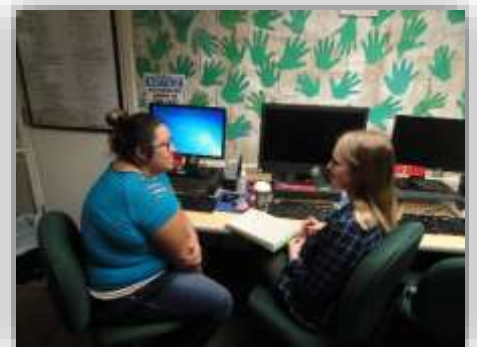
One-on-one peer mentor

Interested in becoming a mentor or a mentee. Contact Sharon at blackfos@nsuok.edu