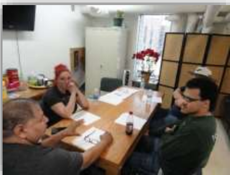
Group meetings once a month.

Interested in becoming a mentor or a mentee. Contact Sharon at blackfos@nsuok.edu