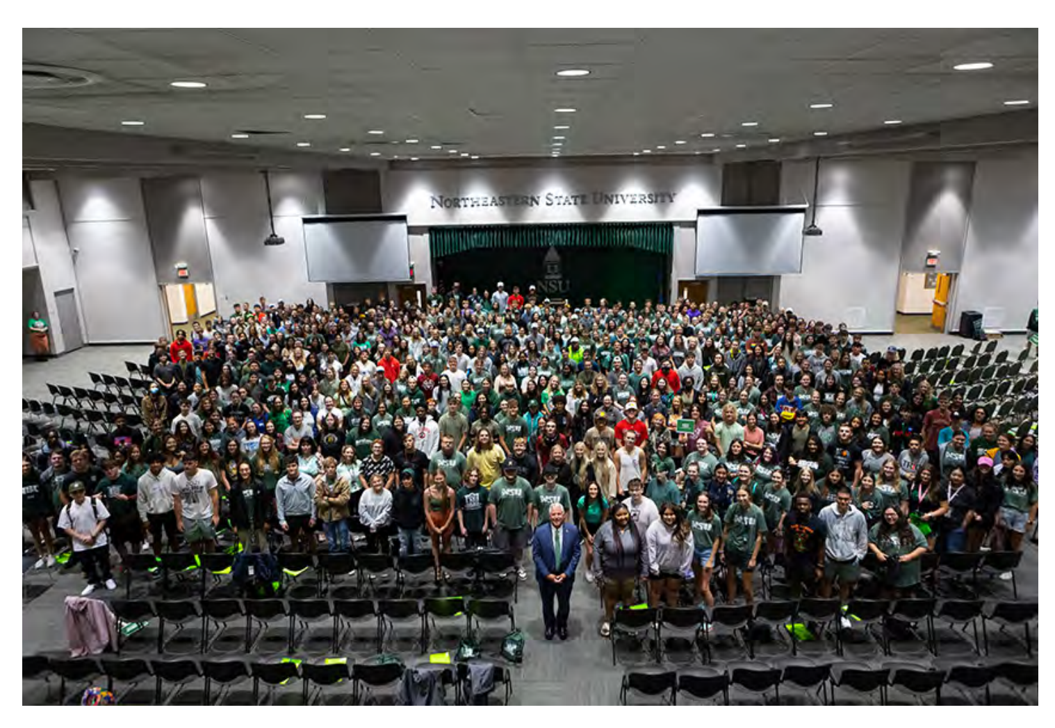
Northeastern State University welcomed 696 first-time freshman for the Fall 2022 semester.