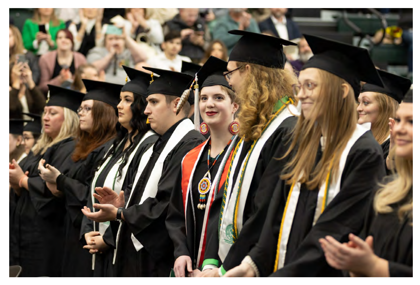
NSU offers degrees and certificates through the Colleges of Business & Technology, Education, Extended Learning, Liberal Arts, Optometry, and Science & Health Professions.