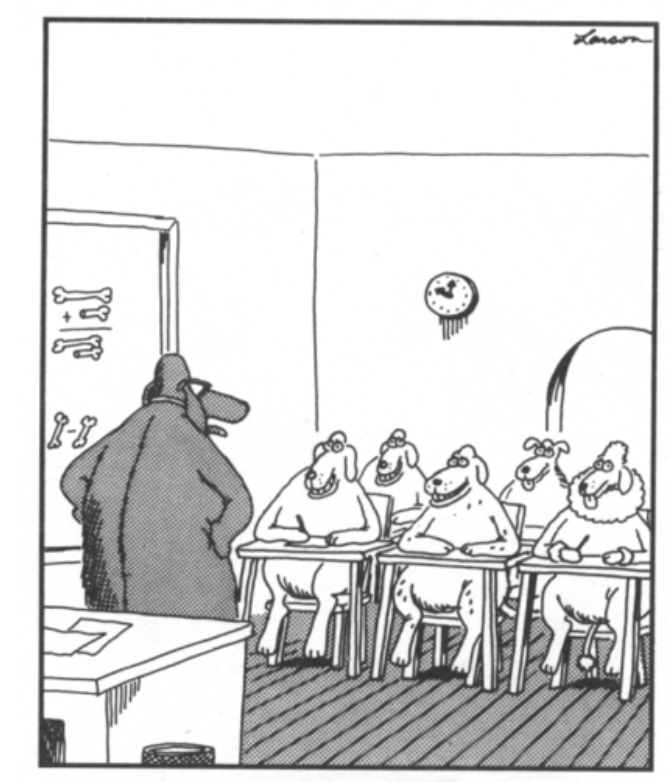
"Well, here we go again. ... Did anyone here not eat his or her homework on the way to school?"