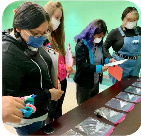
Examining animal fecal samples.