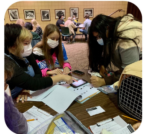
Examining evidence they collected around the zoo.