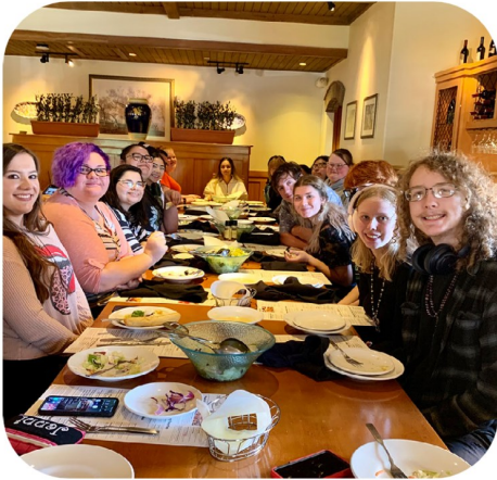
Dinner at Olive Garden

Throughout the evening students were introduced to different animals, were taught how to Zoologists investigate animal trafficking, and learned all about the scientific differences between animal species.