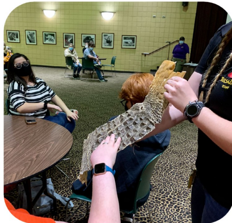
Students got a chance to feel real alligator skin.