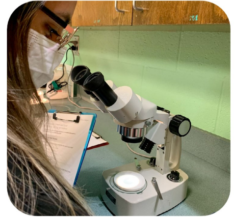
Viewing parasites under the microscope!