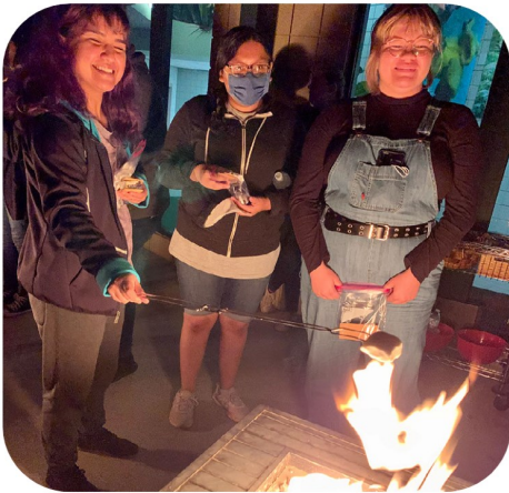
Students enjoyed smores under the stars!