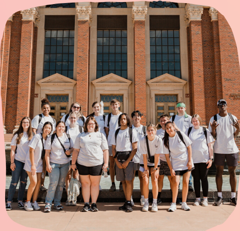
College Campus Visits

Currently there are 530 TS programs funded in the U.S. NSU is incredibly fortunate to have TWO Talent Search programs funded. Together our 2 programs work with 1,000 students in grades 8-12 in 17 area high schools. Everyday our Nationally Recognized ETS Program is helping students achieve their college and career dreams!