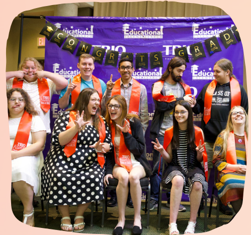
Sweet Senior Send-Off

Thank you for everything you do. I can't even begin to tell you what you've done for our family. We truly love you.